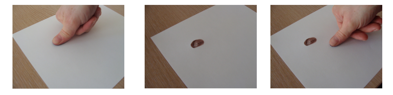
2. Press your finger on a sheet ... it will be the head. Then start again for the body. !!! Don't press to hard and make several tests on a draft sheet before you begin your drawing !!!

Then press your thumb on the brown paint. The lines of the tip of the fingers are different for every one. Their impressions allow the policemen to identify individuals with assurance !